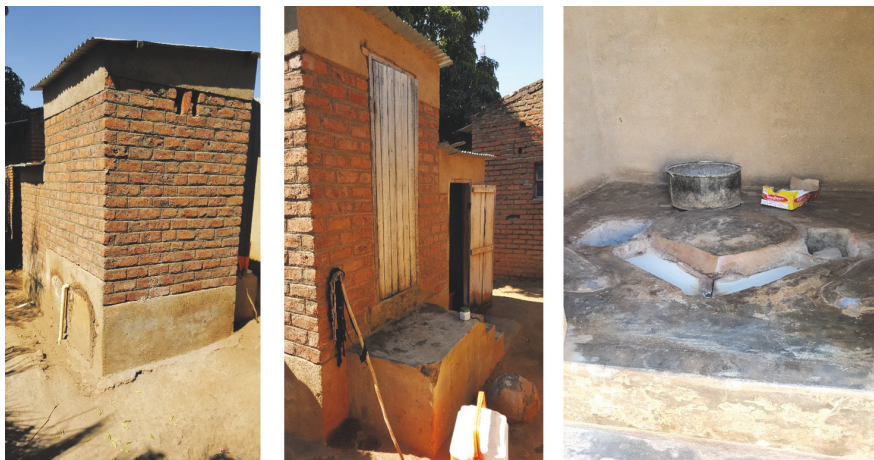
FIGURE 2: UDDT back view, front view, and inside showing urine diverting system and two drop holes, Blantyre, Malawi.

produced from these latrines is unsafe for use in agriculture and increases the health risks to the communities [2, 10, 11].