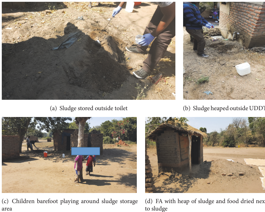
FIGURE 4: Faecal sludge storage and possible exposure pathways.

In order to approximate the amount of EcoSan sludge ingested by people, men aged between 20 and 50 years owning and using EcoSan toilet were used to estimate exposures doses as it was difficult to approximate exposure doses for every member of the household. In rural areas of Malawi, men are often in charge of building toilets, emptying them, transporting EcoSan sludge to gardens, and also applying of the EcoSan sludge in the gardens. The following formula was used to approximate the sludge dose: