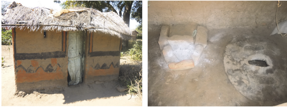
FIGURE 1: Fossa antenna superstructure and inside the latrine in Chikwawa.